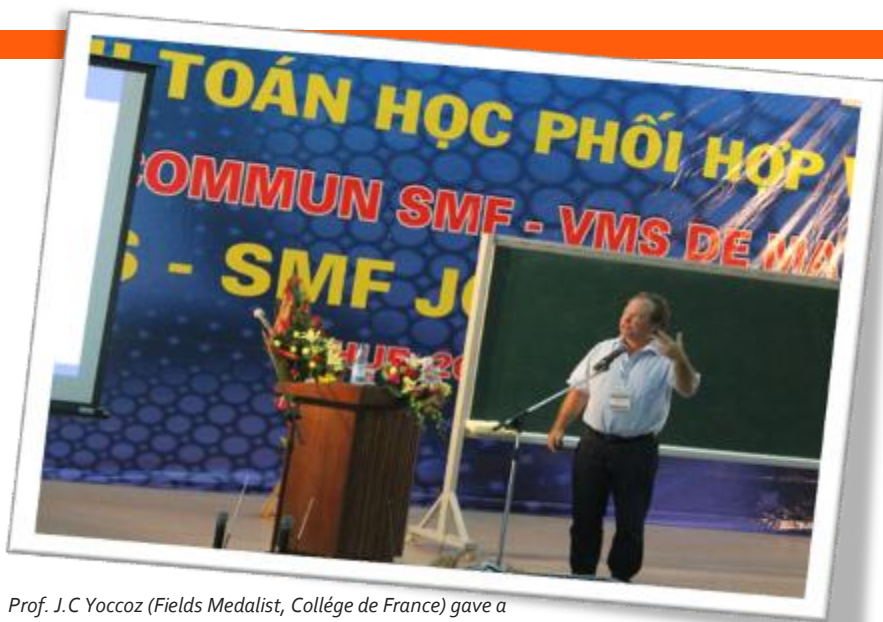
Prof. J.C Yoccoz (Fields Medalist, Collège de France) gave a plenary lecture at VMS-SMF joint congress.

AM is organized following the example of Bourbaki seminar. We invite first-rate mathematicians to report on exciting developments in their field of expertise, and generally not on their own work. The reports are to be written by the time of the meeting and collected and refereed in view of publication in a special issue of Acta Mathematica Vietnamica. Lectures at AM-2012 were already published in Vol. 37, No. 4 (2012).