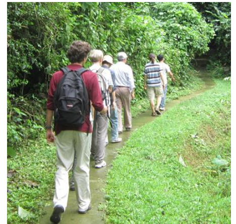
An excursion to Cuc Phuong National Park, Ninh Binh, Vietnam.