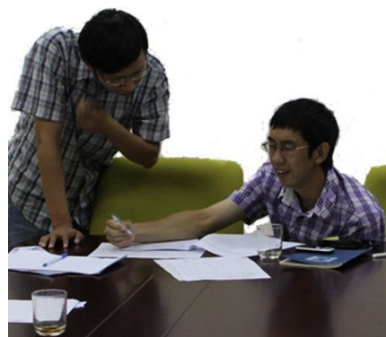
Students discussing at the Summer School 2012 "Some basic theorems in analytical number theory".