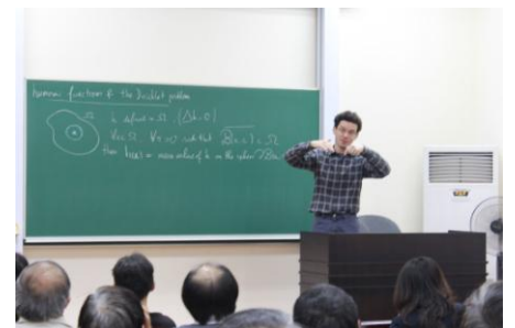
Prof. W. Werner (Fields medalist, Paris 11) giving a mini-course at VIASM.