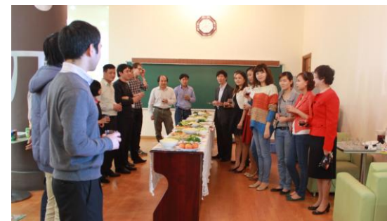
Traditional last lunch before the 2013 Vietnamese Tet (Lunar New Year) at VIASM.