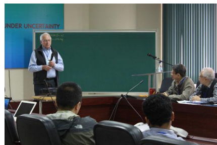
Prof. R. T. Rockafellar (Washington, Seattle) at Spring school "Analysis and approximation in optimization under uncertainty".