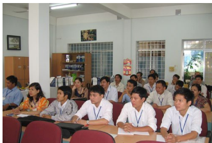
Teachers at the second training school for high school math teachers (Da Nang, October 2013)

Training schools for high school gifted students specializing in math were also held, the first one in Hanoi and the second one in Ho Chi Minh City. These schools aimed to strengthen high school gifted students knowledge for math contests in Vietnam.