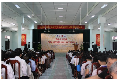
The 8th Vietnamese Mathematical Congress in Nha Trang (August 2013)

talk about their work in research, teaching and applying mathematics. This is also the forum to discuss the contemporary issues of the mathematical development of Vietnam. The congress was also supported by the NPDM.