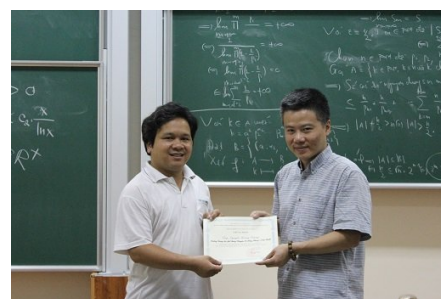
Prof. Ngo Bao Chau handing the certificate to a participant at the first training school for high school teachers (Hanoi, Aug 2013)