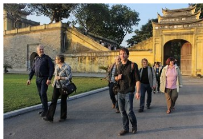
A visit to Thang Long Imperial Citadel during CA 2013 Conference (December 2013)

From time to time, VIASM also organizes excursions in order to strengthen participants' knowledge about the landscape and history of Vietnam, as well as solidifying the relationship of the researchers and visitors.