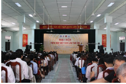
The 8th Vietnamese Mathematical Congress in Nha Trang (August 2013)

talk about their work in research, teaching and applying mathematics. This is also the forum to discuss the contemporary issues of the mathematical development of Vietnam. The congress was also supported by the NPDM.