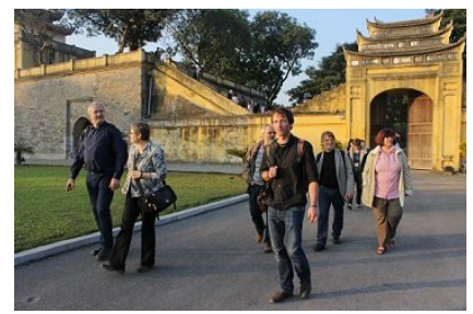
A visit to Thang Long Imperial Citadel during CA 2013 Conference (December 2013)

From time to time, VIASM also organizes excursions in order to strengthen participants' knowledge about the landscape and history of Vietnam, as well as solidifying the relationship of the researchers and visitors.