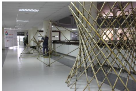
Setting up for the Math Open Day