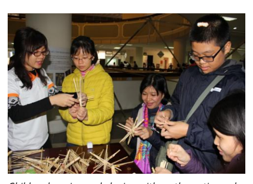
Children learning and playing with mathematics under the instruction of volunteers in the Math Open Day.