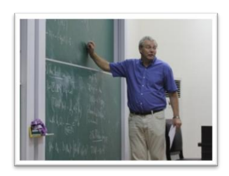
Prof. Matthias Hieber (Technische Universität Darmstadt, Germany)

Central attention of the workshop focused on the well-posedness (or ill-posedness) and asymptotic behavior of solutions to evolution equations such as stability, periodicity, almost periodicity, existence of invariant manifolds for solutions to evolution equations. Applications to incompressible fluid flows, heat diffusions, implicit dynamical systems, control systems, gene propagations and algebraic differential equations have also been given.